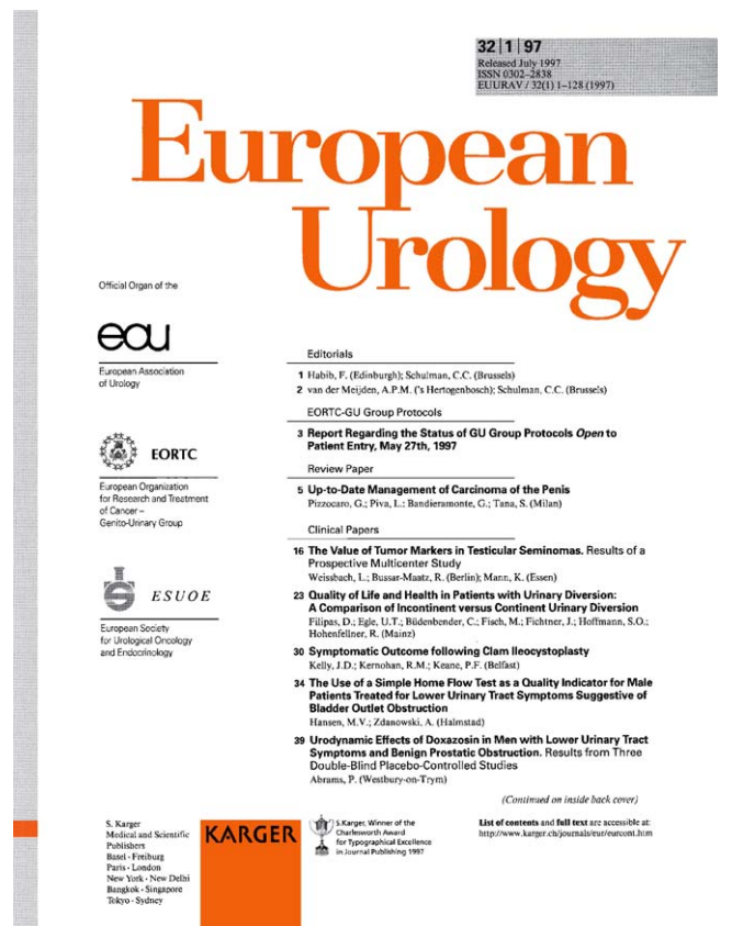
Fig. 6. Front cover in 1997.

In early 2003, EUROPEAN UROLOGY entered the electronic era, being one of the first journals to use an entirely electronic web-based submission and peer-review process that was only available to a limited number of journals.